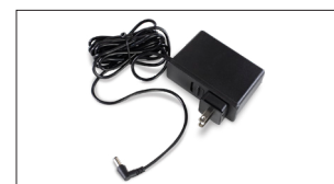
Ameda Pearl AC Power Adapter North America/AU/Philippines 201X05