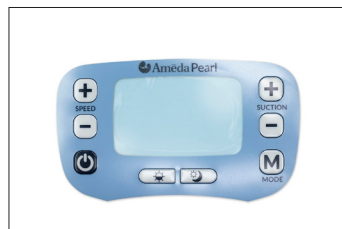
Ameda Pearl Replacement Screen Overlay Panel 201X04