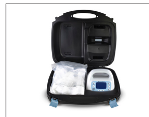
Ameda Pearl Hard Shell Transport & Storage Case 501M03