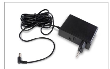
Ameda Pearl AC Power Adapter EU/UK/Asia 201X06