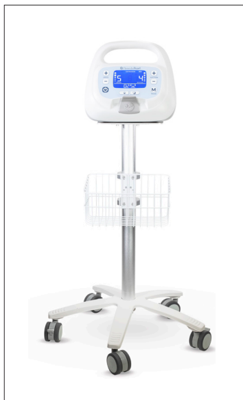
Ameda Pearl Trolley 201H01