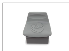
Ameda Pearl Tubing Port Cover 201X08